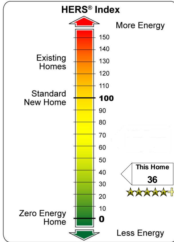
Estimated Annual Energy Consumption